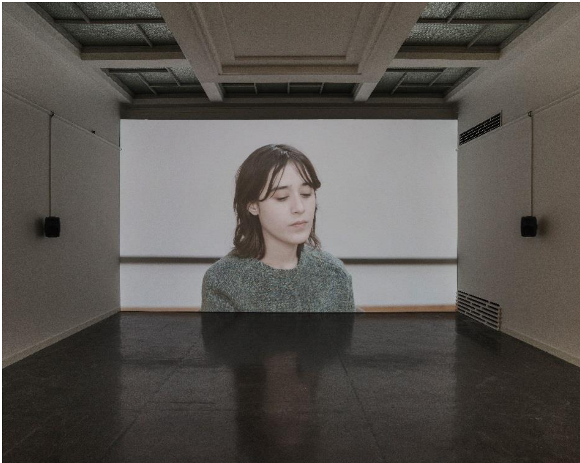
Ane Hjort Guttu, Times Passes , 2015, TKM/ Anders Solberg

Guttu's most recent exhibitions include the two solo exhibitions eating or opening a window or just walking dully along , Bergen International Festival Exhibition 2015, Bergen Kunsthall; and Time Passes , South London Gallery, UK, 2015. In 2015, her work has been included in 'Future Light', Vienna Biennial, Austria; 'Europe – The Future of History', Kunsthau Zurich, Switzerland; 'The Shadow of War', Kunsternes hus, Oslo; and in the film festivals Images Festival, Toronto, Canada; Rotterdam Film Festival, The Netherlands; Nordic Panorama, Sweden; and CPH:Dox, Denmark. Guttu's film Time Passes is co-produced by Bergen Kunsthall and co-commissioned by Lorck Schive Art Prize and South London Gallery. www.anehjortguttu.net